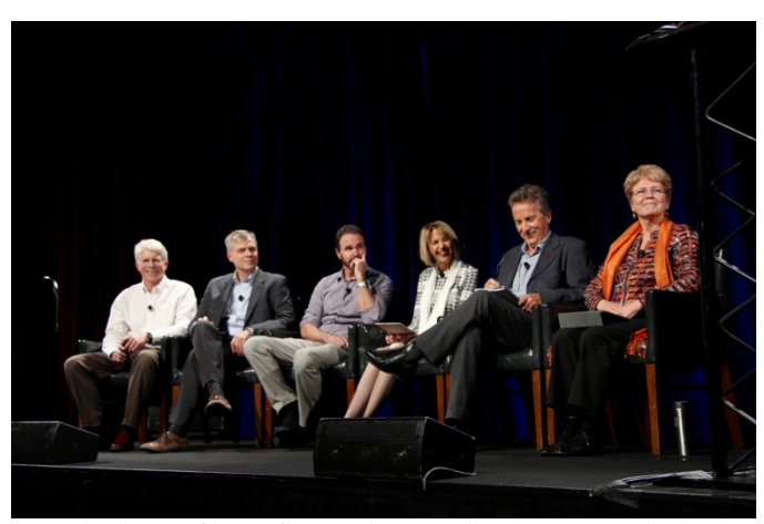
Top scientists and journalists on SMM conference communications panel.

The sanctuary's involvement spotlighted the sanctuary as a sentinel site for marine mammals and ecosystem assessment, and fostered collaborations on marine mammal research. Communications staff headed the Conference Media Team and coordinated global coverage. This conference focused strongly on science communications with workshops and panel discussions to help scientists and managers reach out effectively with media, the public, and with policy makers.