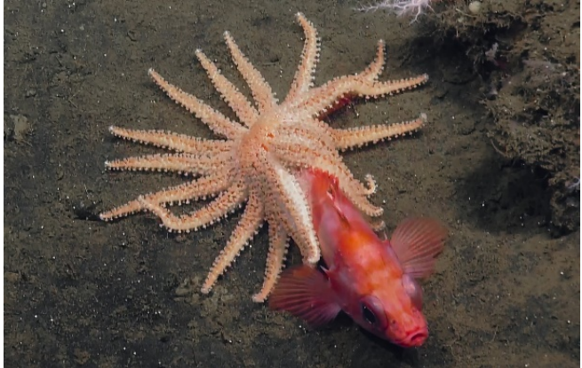
Rockfish caught off guard by a hungry sea star.

http://Farallones.noaa.gov/manage/Sanctu ary Advisory Council.htm or contact Alayne Chappel at <u>alayne.chappel@noaa.gov</u> to subscribe to the SAC list serve.