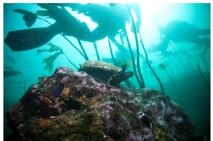
Divers among kelp and urchins at Del Mar Landing, Sonoma County.

the North America section of the Global Kelp Restoration Workshop. The workshop is a joint effort with The Nature Conservancy and the University of New South Wales to create a publication titled Guidebook on Kelp Restoration , an effort to outline global case studies of kelp loss and provide guidance for kelp restoration efforts. The workshop included ocean managers and nonprofits involved in kelp research and restoration in North America, primarily along the West Coast. Farallones staff is contributing information about the development of the Kelp Recovery Program and the Sonoma-Mendocino Bull Kelp Recovery Plan in the guidebook.