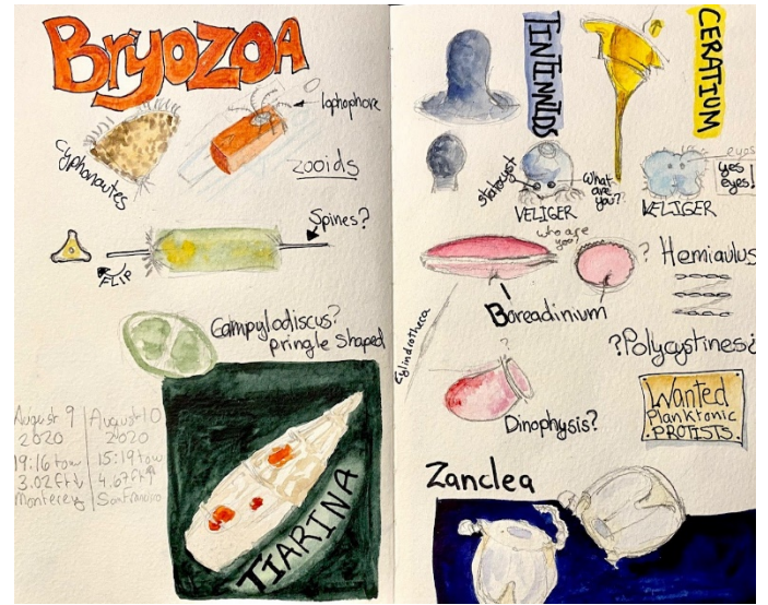
Journal sketches and identifying notes on plankton from GFNMS Pier on San Francisco Bay.

This virtual workshop reached a broad audience of ocean enthusiasts that may not be aware of sanctuaries and the role they play in protecting these living resources. With visitor centers closed, staff and volunteers are innovating new opportunities and platforms through which to educate and inspire the public.