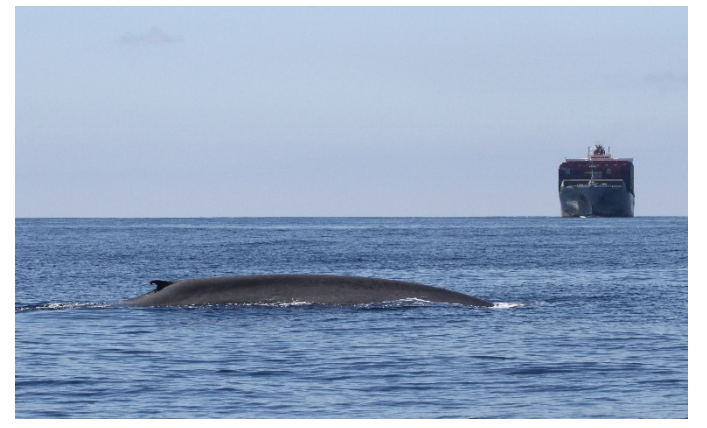
Blue whale in path of oncoming ship.

These efforts demonstrate NOAA and ONMS commitment to conservation and the blue economy by providing mariners with information and recognition for actions that promote the protection of endangered whales.