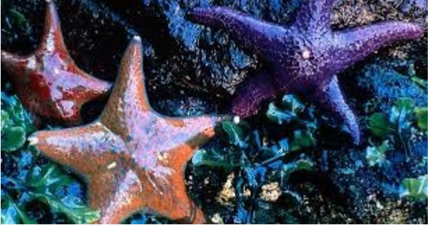
Echinoderms such as sea stars play key roles in intertidal communities.

The instructors used videos, interactive polls, and live artifacts to demonstrate relevant points. Lastly, participants were sent a handdrawn template of the intertidal zones and encouraged to draw organisms they observed during the workshop to create their own guide to take on their next tide pooling trip.