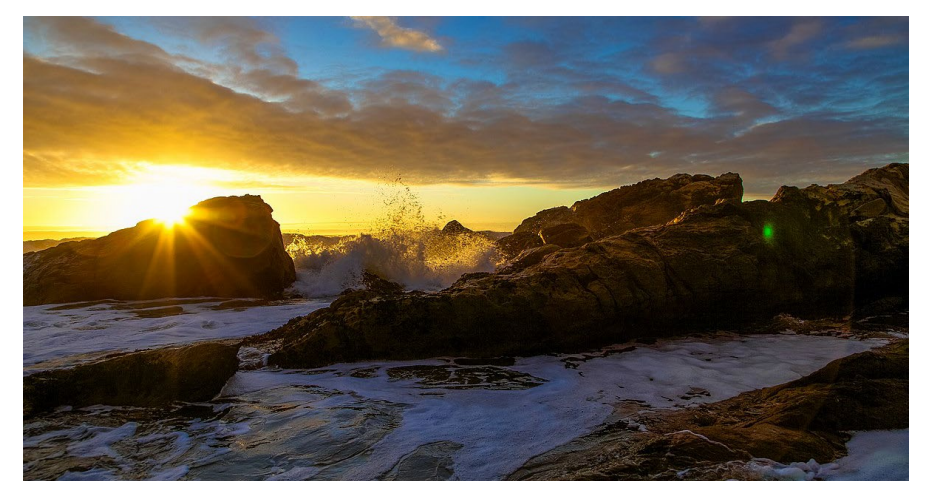
Schooner Gulch at sunset.

In 2021 we continue into a new decade, more confident than ever that, with your support and involvement, we will achieve our mission of ocean conservation.