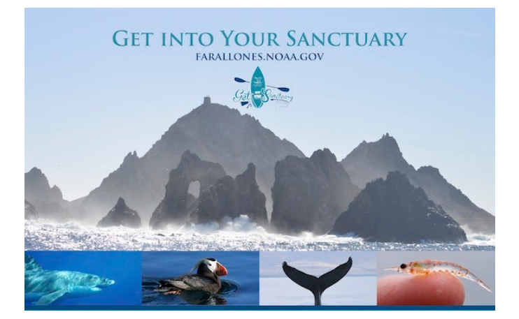
Naturalist-led virtual cruise highlights the extraordinary array of wildlife in Greater Farallones National Marine Sanctuary.

Virtual programs provide an opportunity to maintain connections with the Sanctuary Explorations community. They also connect new audiences outside the San Francisco Bay Area, who could not normally participate in field excursions when they take place in person.