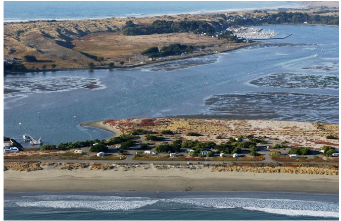
Beach and dune habitat on Doran Beach (foreground) protects wetlands and a major harbor but faces erosion from impacts of sea level rise.

Receiving recognition in the primary peerreviewed journal for coastal decision-making and coastal issues increases the awareness of the sanctuary, and invites others to consider taking similar measures in their approaches to coastal conservation.