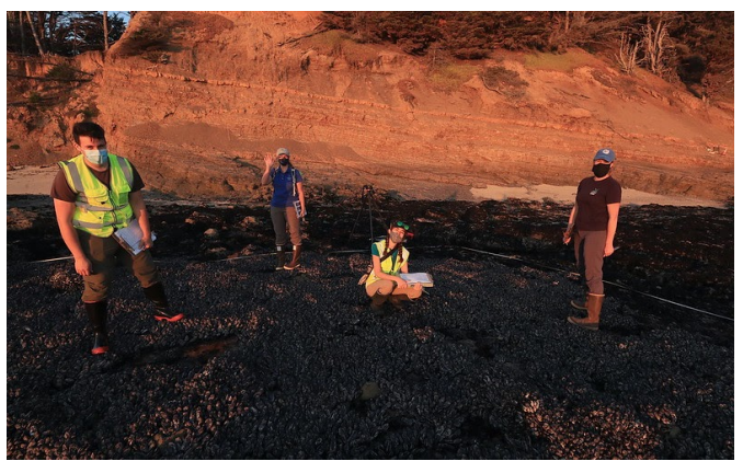
Members of the Greater Farallones Association conservation science team collecting intertidal data for the LiMPETS program.

LiMPETS completed fall data collection on November 16, 2020 under California's Marine protected area monitoring program 2019-2021 funded by the Ocean Protection Council in collaboration with researchers at the University of California Santa Cruz. Following local public health and safety recommendations, staff surveyed 10 sites, from San Pedro to Moss Beach. LiMPETS continues to engage students online during the pandemic, teaching them how students like themselves contribute to collaborative conservation efforts. Data will be reported to the Multi-Agency Rocky Intertidal Network (MARINe) for inclusion in their database and incorporated in California's 10-year Marine Protected Area monitoring network report.