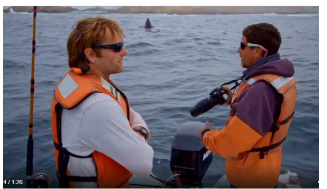
White shark pops up precisely where they weren't looking! (It happens.)

On September 26, over 1,206 live views (devices/one or more persons) in 10 countries, from Indonesia to Croatia to New Zealand, experienced the sanctuary's first Virtual Sharktoberfest<sup>TM</sup> – an annual event to celebrate the white sharks of Greater Farallones. At least 2,000 more, and rising, viewed the program since. This event featured the latest shark research, award winning conservation films, and an "Awesome and Jawsome" shark experts' panel discussion.