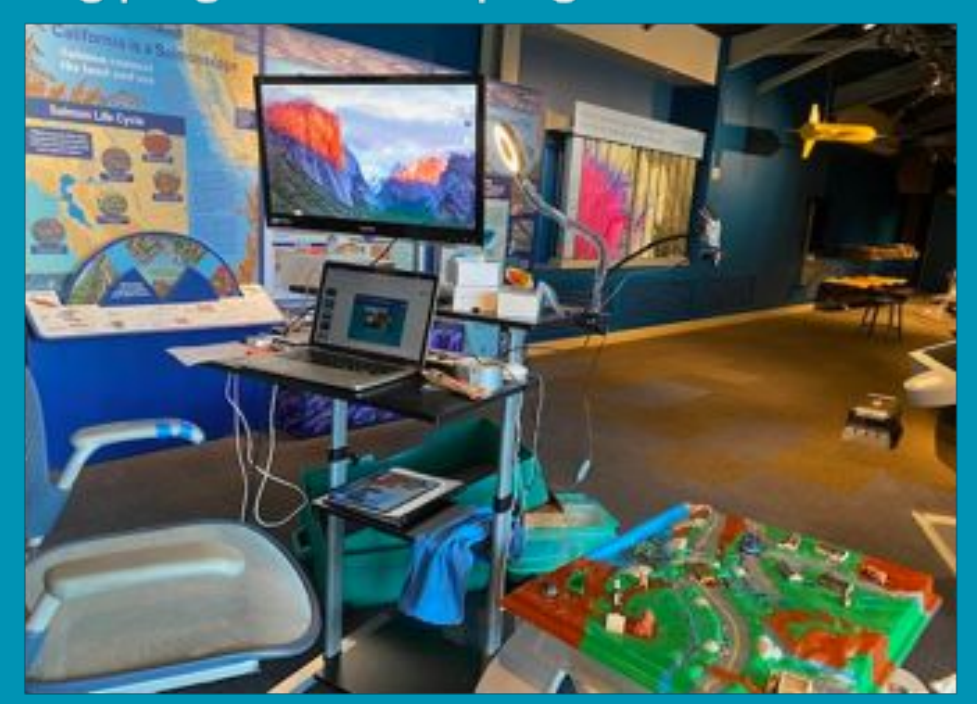
Photo: The Distance Learning Setup at the Sanctuary Exploration Center, Chelsea Prindle