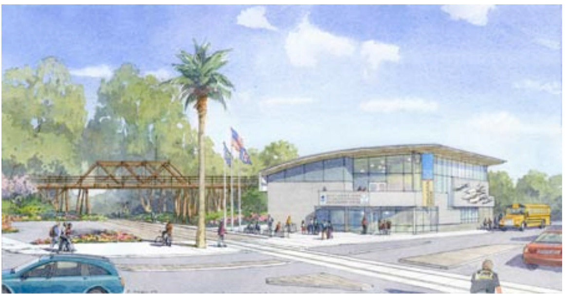
Figure 3. Depiction of the MBNMS Santa Cruz Exploration Center currently under construction using LEED® building standards.