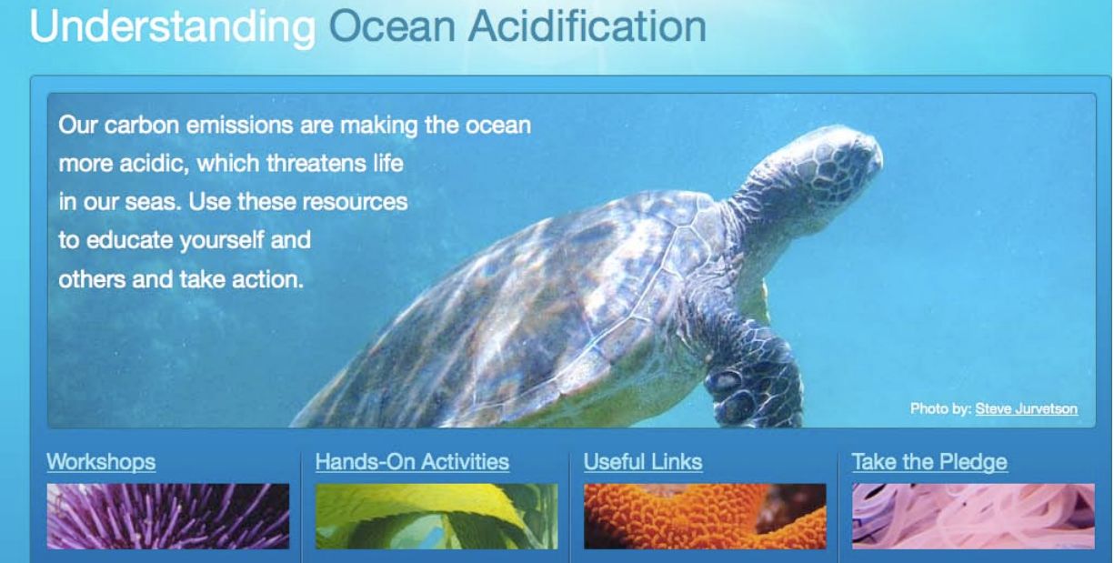
Figure 2. Screen Shot of Understanding Ocean Acidification Web Site, <a href="http://cisanctuary/acidocean">http://cisanctuary/acidocean</a> <a href="http://cisanctuary/acidocean">Strategy 4: Mitigating Damages to Sanctuary Resources</a>

Year 5: $125K including $70K for 2/3 time FTE to implement OA Education, $15K evaluation, $40K determine based on evaluation, what activities programs and work best and implement, analyze data, produce evaluation report. Limited progress can be made with existing staff resources. Some sub-activities are ideal for grant funding