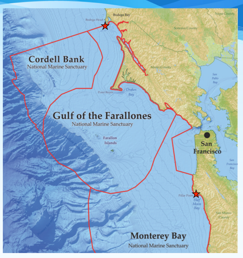
Half Moon Bay to Bodega Head