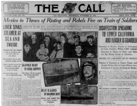
Publication: San Francisco Call

Newspaper coverage for the loss of the SS Selja .